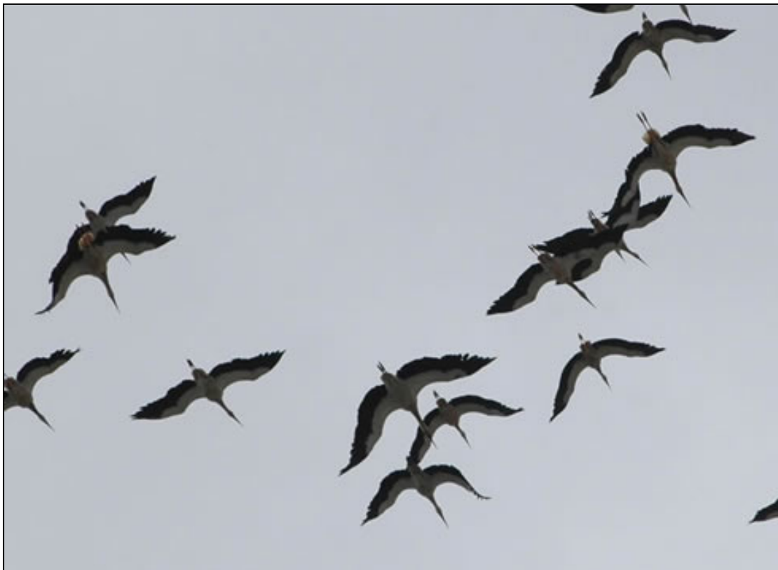
White Storks about to land on the cliffs below Windmill Hill

06 Mar: Better weather was reflected in migration picking up, with 1275 Black Kites , 22 Short-toed Eagles , 12 Egyptian Vultures , and 6 Black Storks seen among a sprinkling of other species.