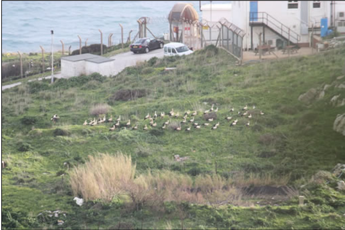
White Storks resting on Windmill Hill Flats

to land on the cliffs below Windmill Hill Flats, a very rare occurrence. Some flew on about two hours later, watched by HRH The Princess Anne while on a walk up Mediterranean Steps. The rest stayed on the Flats themselves for a while longer until the wind strength decreased.