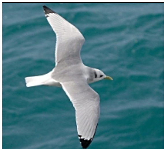
Kittiwakes feeding along Little Bay

Gannets were diving on a shoal of small fish and 3 Great Cormorants were also present, but as the northerly winds intensified most of the birds moved out into the Strait.