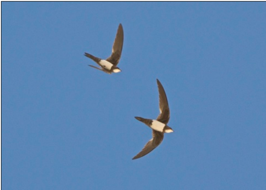
Alpine Swifts on the North Face of the Rock

16 Jul: A Zitting Cisticola was heard calling on the Talus slope, and close by the colony of Alpine Swifts was active with up to 10 birds wheeling around and entering fissures in the cliff face where their nests are found. These are located 35m above sea-level, on the North Face of the Rock.