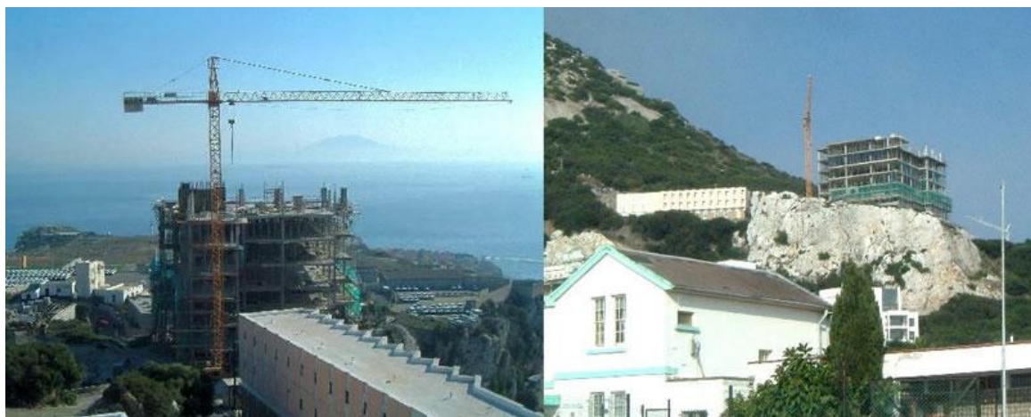
The monstrous Clifftops which has still not reached its maximum height.

GONHS now requests those contesting next week's elections to undertake to take steps when elected to ensure that the Clifftops building is reduced in height in order to maintain the historic shape of Gibraltar and to re-instate the views from Jews' Gate and from Mediterranean Steps.