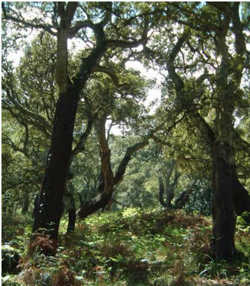
A typical woodland scene in Alcornocales