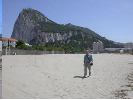
Pacing the sandy waste