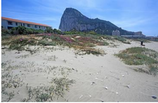
Western Beach then