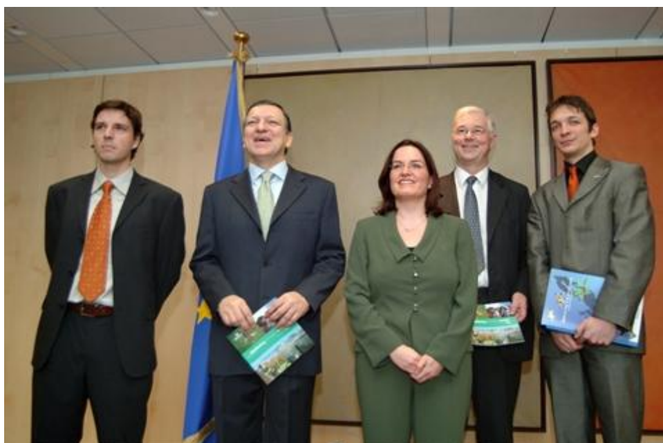
BirdLife representatives meet with President Barroso