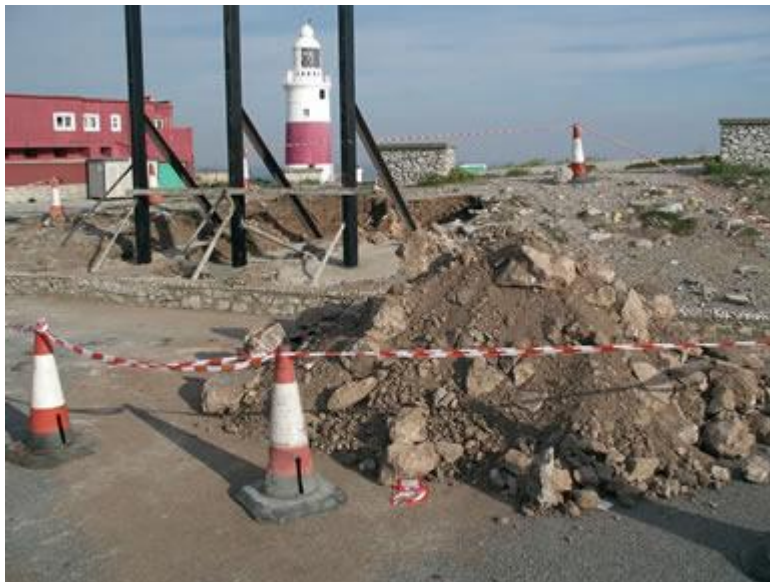
The works in progress