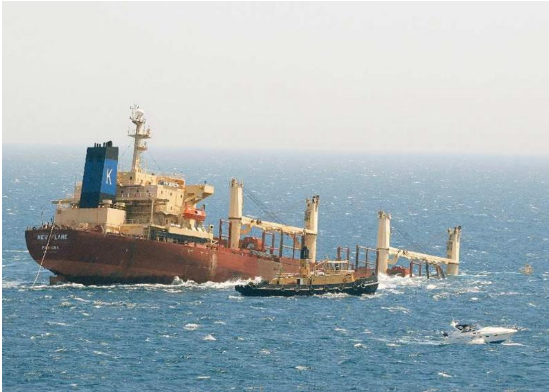
The cargo vessel New Flame wrecked 600m off the Marine Observatory.