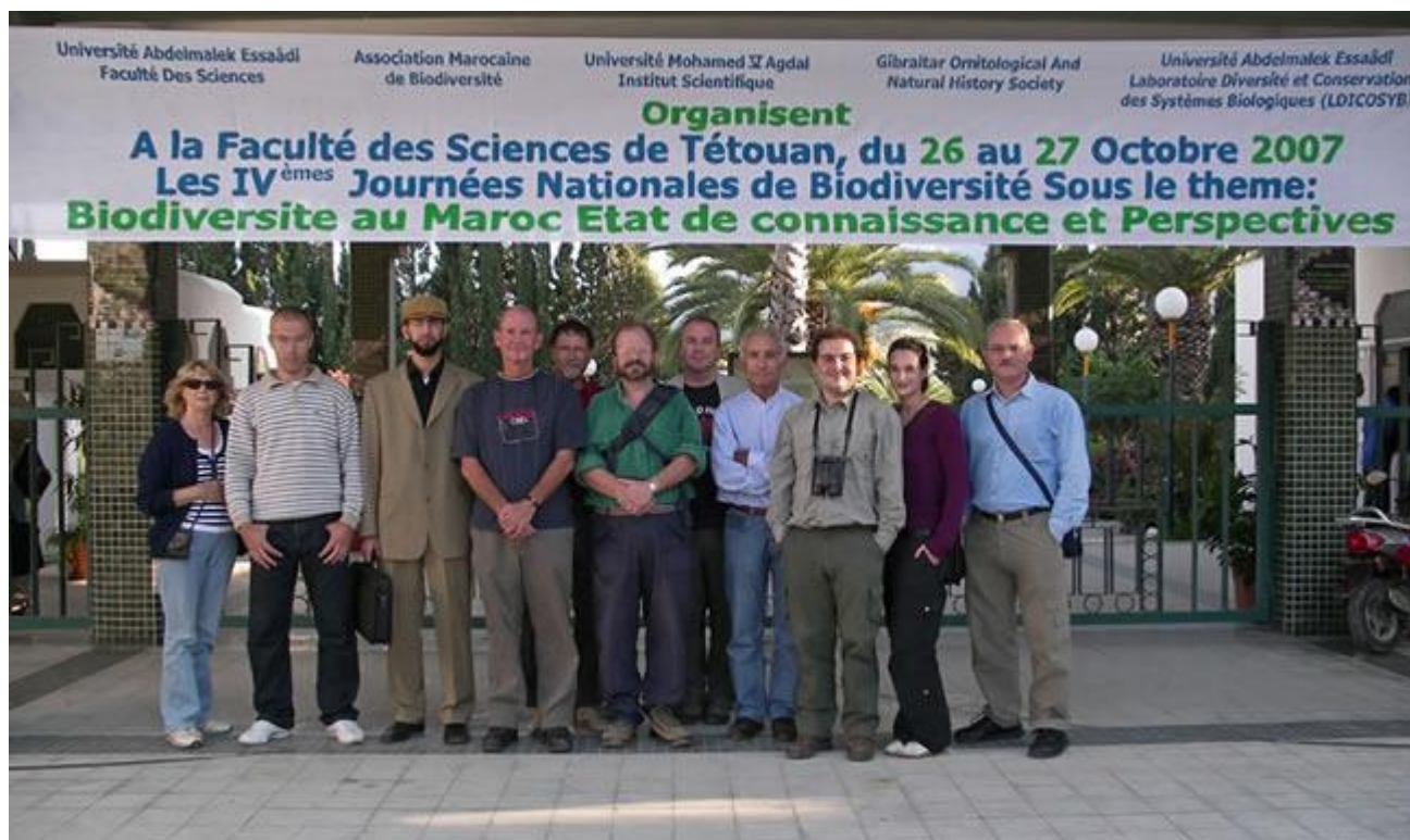
Part of the GONHS/Rabat delegation

GIBMANATUR continues during 2008, with a number of publications containing the results of the work expected during the year.