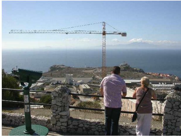
The view across the Straits as it once was.